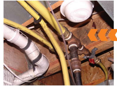
CORRUGATED STAINLESS STEEL TUBING — GAS PIPING